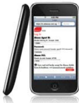
GUI Login Page

This user-friendly and ultra convenient programme is a part of Abacus' suite of mobile solutions and is designed with rich functionalities to enable travel consultants to extend support to customers during urgent or critical situations, such as flight delays and date changes. With Abacus Mobile, you can now provide value-added services that translate into greater customer retention, boosting sales and productivity.